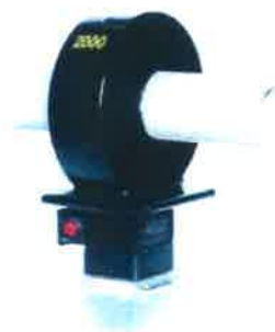
The ABB LG(X) current transformer is a popular choice for North American wind farm developers. This unit features high accuracy.

A key player in the global market is ABB . The company's Medium Voltage Distribution Components Facility is located in Pinetops, NC, USA. Jon Rennie, Vice President & General Manager, is responsible for distribution, automation and components. "These are products used on sub-stations and feeders to measure current and voltage for both metering and production applications. Current and voltage instrument transformers are products that take current and voltage from dangerous levels and reduce them to safe levels to be measured."