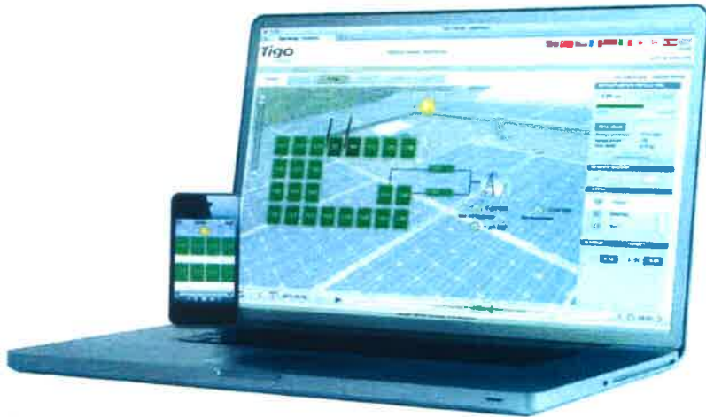
Tigo optimisation technology measures every panel every two seconds.

"A solar farm is set up in a very similar manner. There is often a Red Lion switch on each solar panel itself that will tie back to a central monitoring