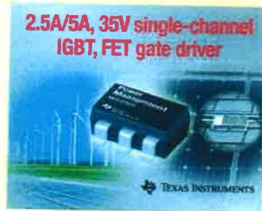
The IGBT is used in renewable energy applications for medium to high power solar and wind inverters, where high power inverters are used.

TI's UCC27531 family of ICs are very small and can be built very close to the switch. "They also have built-in level shifting and the flexibility of an inverting and non-inverting configuration. Also, the number of devices needed within the end inverter system can be reduced. Furthermore, this family has been proven to be an effective driver solution for wide band-gap FETs solutions such as SiC."