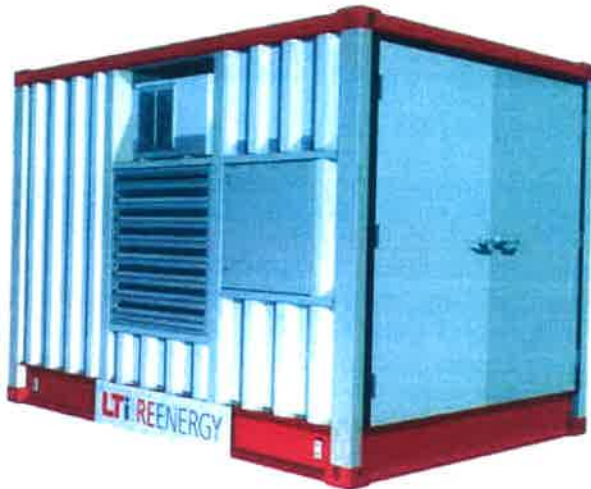
The LTI REEnergy PVmaster with Ampt Mode™ is in a new class of lowest cost, highest performing large-scale solar inverters. This HDPV-compliant inverter's output power rating is increased 60% when deployed Ampt DC/DC converters to lower costs by 40% while operating at greater than 98.6% CEC efficiency.