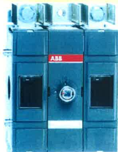
ODTG200US11 - solar switch.