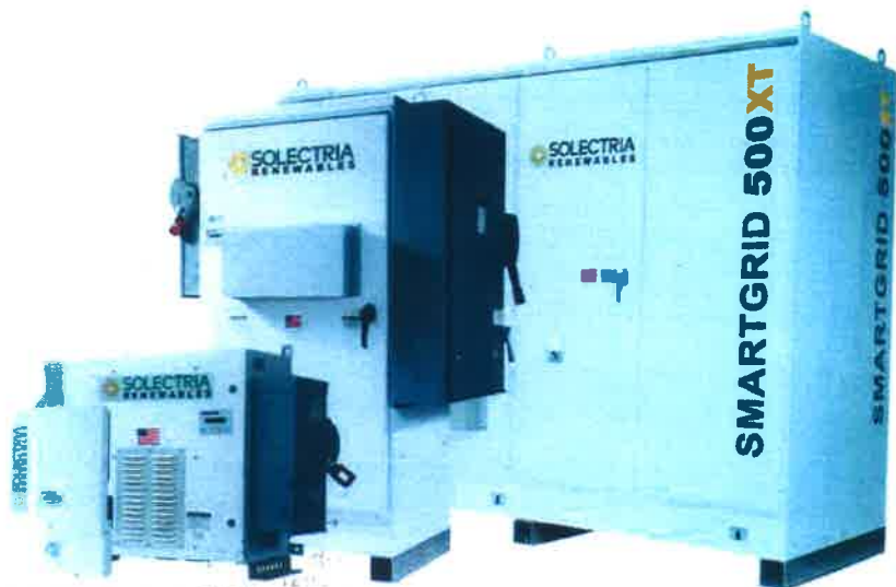
Solectria family of Inverters for all market sizes.

centrally managed at the inverter," Gun explains.